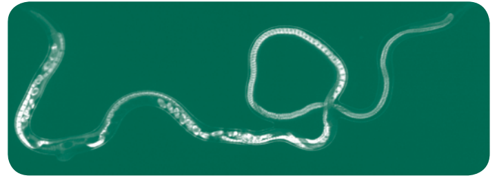
Figure D: Are they resistant? Adult internal parasite with eggs.